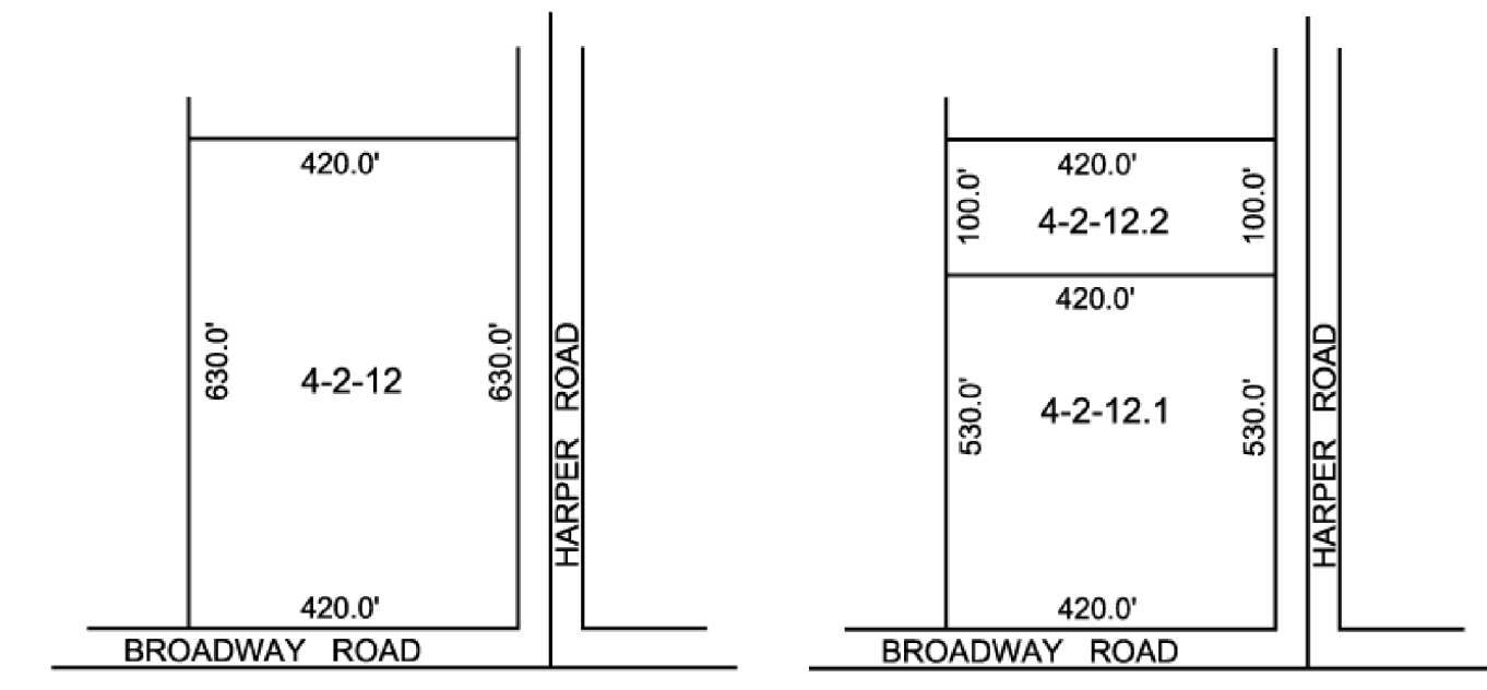
1. SAMPLE PARCEL SECTION-4, BLOCK-2, PARCEL-12.

METHOD OF NUMBERING PARCELS WHEN LANDS ARE DIVIDED OR SUBDIVIDED: