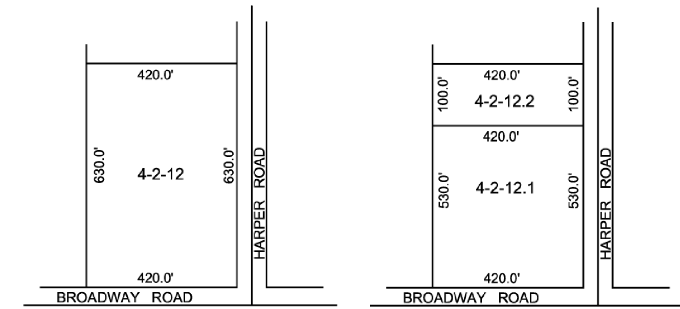
1. SAMPLE PARCEL SECTION-4, BLOCK-2, PARCEL-12.

METHOD OF NUMBERING PARCELS WHEN LANDS ARE DIVIDED OR SUBDIVIDED: